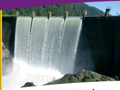
Dam wall monitoring